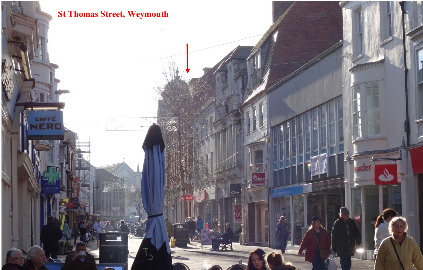
St Thomas Street, Weymouth